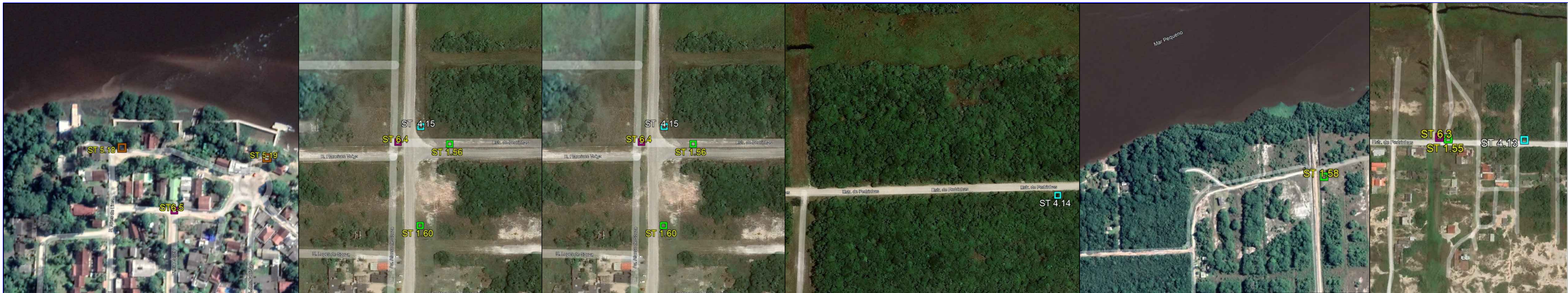
LEGENDA DAS PLACAS: