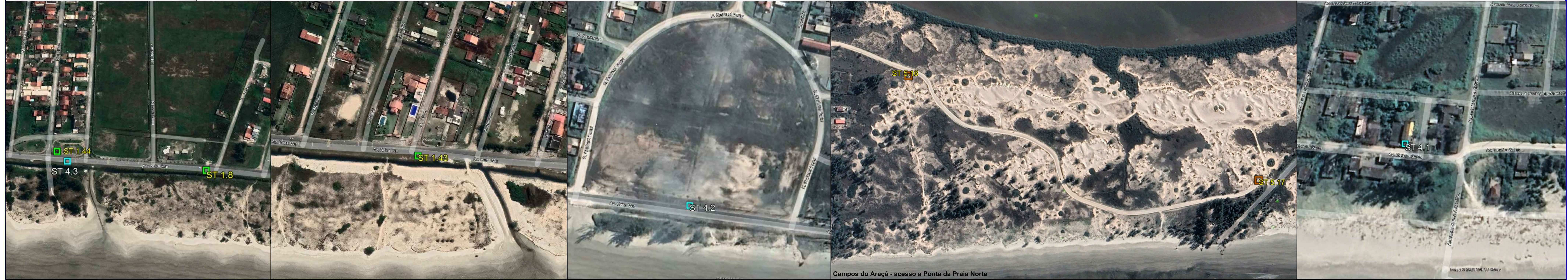
Campos do Araçá - acesso a Ponta da Praia Norte